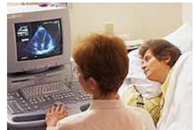
Heart function should be checked in FSHD.

Similarly, breathing difficulties from weakened respiratory muscles aren't common in FSHD, in contrast to their prevalence in some other forms of muscular dystrophy. Testing of pulmonary function at intervals may be recommended for some patients.