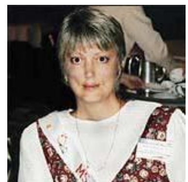
Facial weakness can make it hard to use a straw or even smile.

Of somewhat more concern is the weakness in the eye muscles, which can keep the eyes from closing completely during the night. As the disease progresses, the eyes can sometimes dry out overnight, which can injure them. Waking up in the morning with gritty, burning or dry eyes may be a sign that eye closure isn't complete. Wearing an eye shield or patching the eyes during sleep may be necessary.