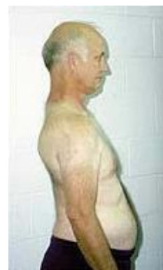
Lordosis is typical in FSHD.