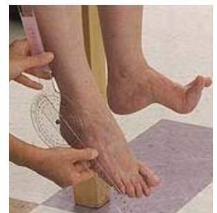
This woman can barely pull back her right foot because of FSHD.